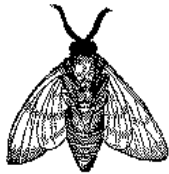
Figure 2: A sample black and white graphic that has been resized with the includegraphics command.

It is also a good idea not to overuse horizontal rules.