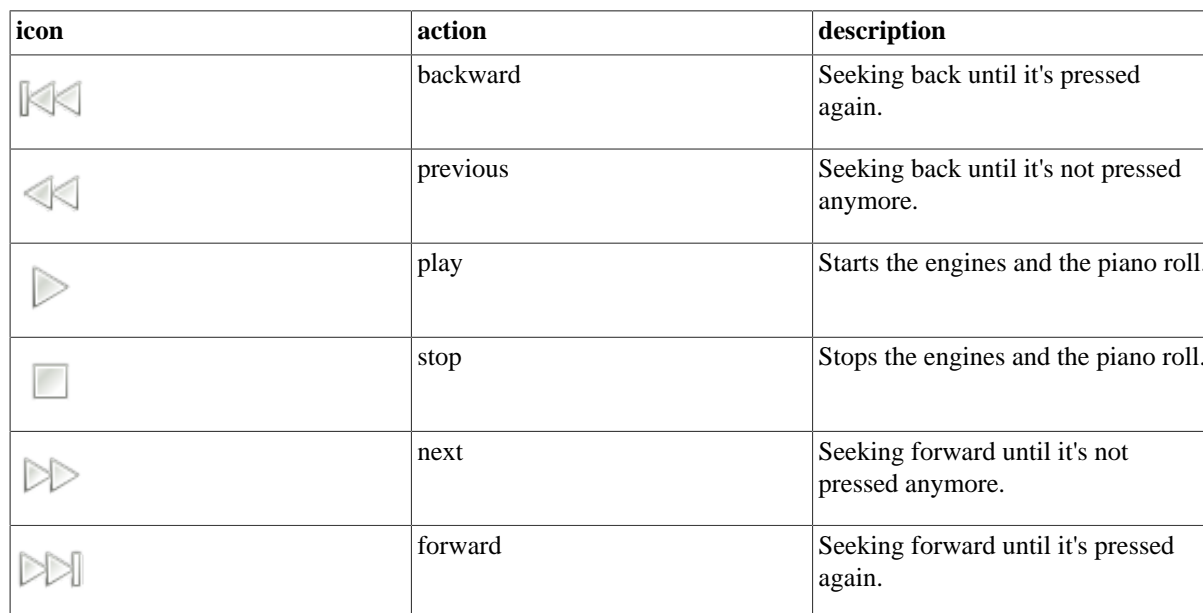
Table 4.1. AGS playback controls table

The loop checkbox enables the loop L and loop R settings below. It causes the notation to loop playback. Auto-Scroll checkbox animates the horizontal scrollbars to follow playback position. Use exclude sequencers checkbox to enable/disable pattern based sequencers.